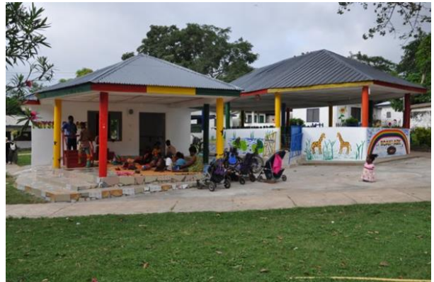
Physio Place and Noah's Ark

The new centre of the Community consisting of three wonderful buildings namely the Royal Community Hall, Noah's Ark and the Physio Palace were officially opened in October. These festivities were accompanied with much pleasure and gratitude.